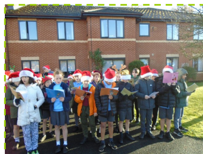
Year 5 Carols at Kennet Court

I am now approaching my fourth year as a governor and I am really hopeful that the next twelve months will bring a return to a more normal way of life in school and in our community.