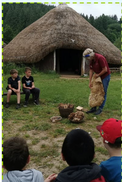
Year 3 enjoying Butser Ancient Farm

Co-opted Governor, Chair of Sites & Buildings Committee, Health & Safety Governor, Eco-Schools/Forest School Governor