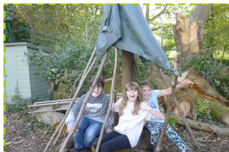
Year 6 Shelter Building

My warm wishes to the Hawthorns family as we hopefully return to normal life.