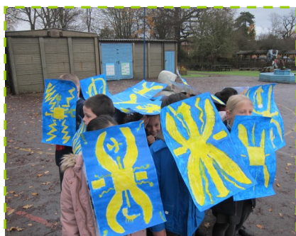
Roman Army day for Year 4

As Covid restrictions further ease, I'm looking forward to getting more involved and contributing more to the school as a Governor both through formal committees and through various school activities to support our vision to 'belong, believe, achieve and grow'.