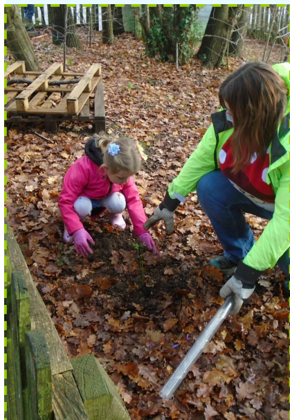
Tree Planting Day

LA Governor, SEND Governor, LAC Governor