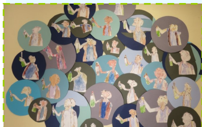
Quentin Blake display by Year 2

This is the end of my fourth academic year as a governor and I am now at the end of my first full term. Although this year has had some similarities to last year unfortunately, I have still continued to enjoy my role as a governor. I have attended all of my meetings virtually which still continues to be the most effective and efficient way for the meetings to go ahead. This year, I joined the Personnel and Finance committee alongside the Sites, Buildings and Health and Safety committee. Both of these committees are extremely effective and the discussions that are had are interesting to be involved with.