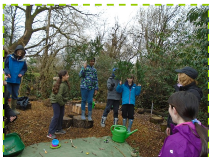
Forest School for Year 5

I can't quite believe another academic year is coming to an end and I have now been the staff governor for over a year and half. It has been another busy and challenging year for The Hawthorns but as always, the staff have rallied round, supporting one another. Governor meetings have continued to take place virtually and although the governing body have got this down to a fine art, all of us are looking forward to time when we are able to hold meetings in person.