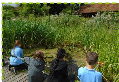
Pond dipping at Woolley Firs

I hope that everyone has a restful summer holiday and look forward to seeing everyone in the autumn term!