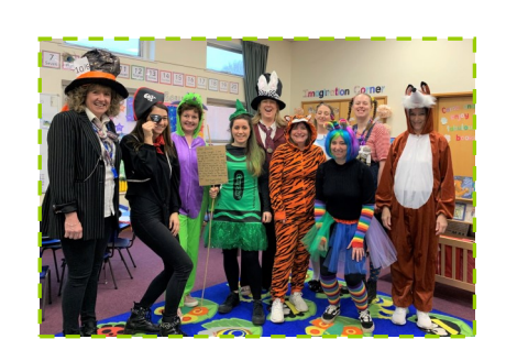
EYFS & Year 1 World Book Day

After half term in February brought World book day and it was great fun seeing all the colourful outfits and joining in with the dressing up part. As a TA and governor I really appreciate being involved in different sides of the how the school operates. It's been strange not being in school for the spring term and beyond but we have all been very busy keeping the cogs turning from our own homes and home offices. The senior leaders, teaching assistants and all the office staff have been so fantastic at keeping the connection between our families and our school during the school closure, we are so very lucky. I really hope to be all together again soon and in the meantime I'm looking forward to joining the year 1 bubble. Next academic year will hopefully be a little more normal again. Best wishes to you all